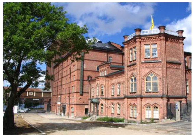
The D:CE/SAMFORSK Vasa Location