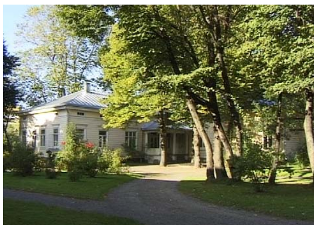
D:CE in Åbo: Hus Lindman.